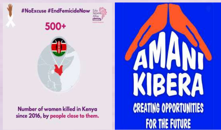
Collaborating with stakeholders to develop viable initiatives that enable women to advance their safety, security and prosperity is key.

Femicide is the killing of a woman or girl because of gender, regardless of motive. It takes many forms but the most common is brutality, often perpetrated by men. Many cases of femicide are not reported as awareness of and campaigns against Gender-based Violence (GBV) have overshadowed it. Globally, there have been 45,000 recorded cases of women and girls killed by intimate partners and family members.