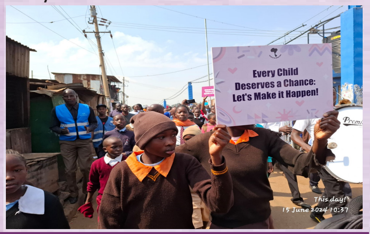
Some of the students proudly displaying one of the day's thematic messages

The day pays homage to the estimated 176 children who died during the Soweto Uprising in 1976 where peaceful protests and demonstrations by 20,000 participants were met with police brutality. It holds an important significance in our shared history, immortalizing the bravery and resilience of these children.