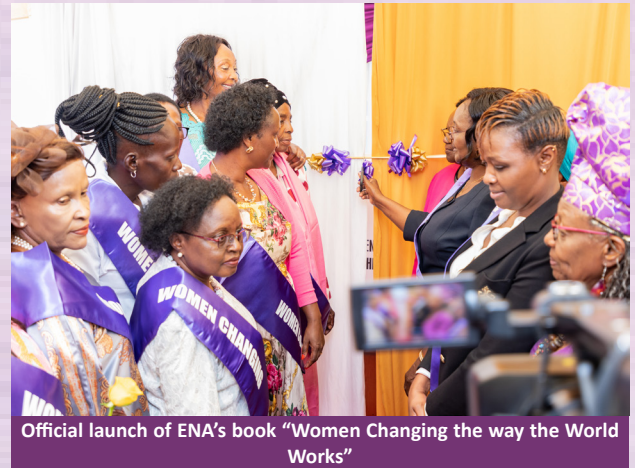
Official launch of ENA’s book “Women Changing the way the World Works”

Echo Network Africa hosted a momentous gathering on 7th March 2024, ahead of International Women’s Day celebrations.