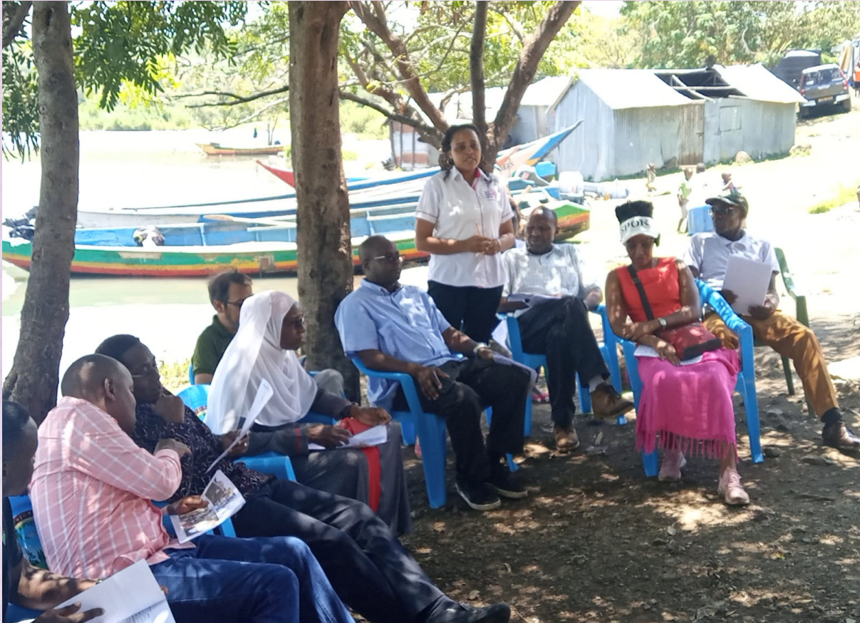
M-SAWA Project in Mbita aimed at enhancing women's participation in the Aquaculture Value Chain.

Community Resilience & Livelihoods/Financial Inclusion