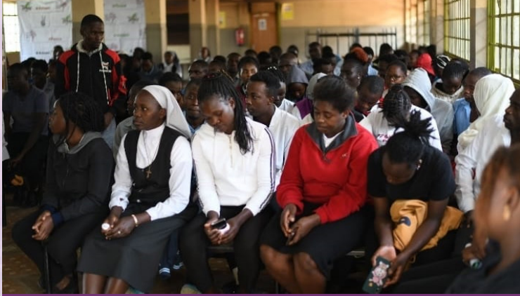
Kibera: Two sessions were held with one session reaching 200 young people aged between 15 and 25 years.