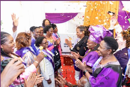
Official launch of the ENA's book "Women Changing the way the World Works"