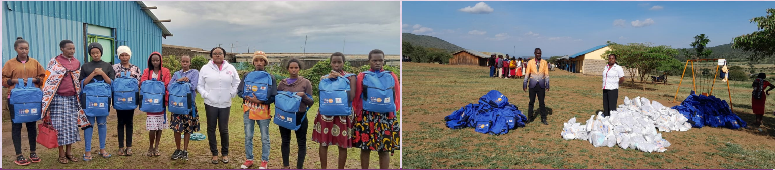
Echo Network Africa distributes essential supplies donated by UN Population Fund (UNFPA) in Narok County.

On 3rd of March, a heartwarming initiative unfolded in Narok villages as the UN Population Fund (UNFPA) joined hands with Echo Network Africa to address pressing issues affecting young people.