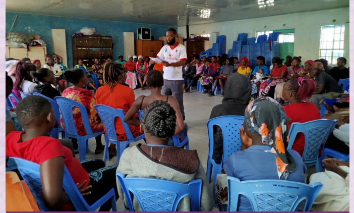
Mukuru Kwa Njenga: A single-gender dialogue was held reaching a total of 92 women.

On 1st of March, Peace and Conflict Resolution Programme Center embarked on a transformative journey with their newly onboarded Local Implementing Partner (LIP), Amani Kibera. With a focus on Peace and Education, their collaboration promises innovative solutions to address the pressing challenges facing Nairobi's marginalized communities.