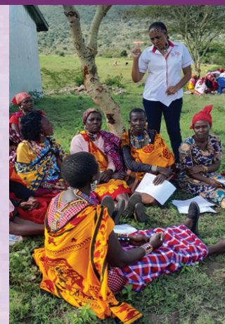
Members paying attention to instructions during loan forms signing