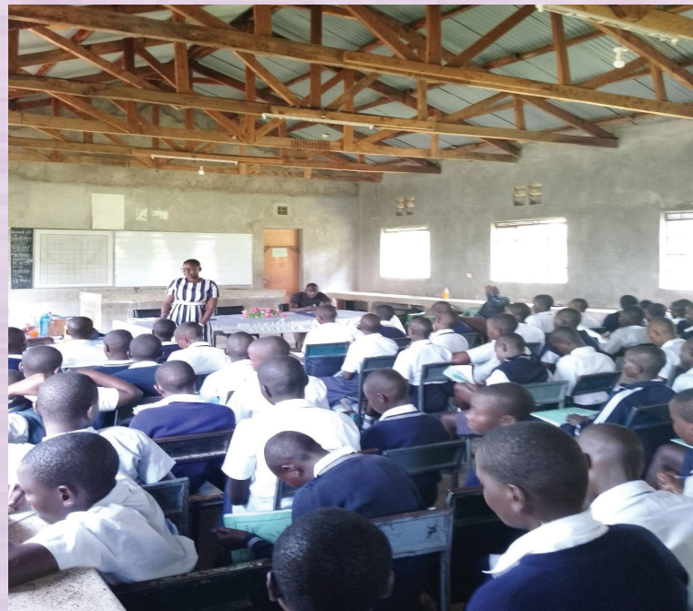
Students of Ongeti School keenly following the Mentorship Programme

Addressing Menstrual Hygiene Management (MHM) with sensitivity, Girls Excel Initiative broke taboos, providing practical guidance for a healthy and informed approach. The collaborative efforts of partner organizations underscored a commitment to shaping a future generation empowered to navigate challenges and contribute meaningfully to society.