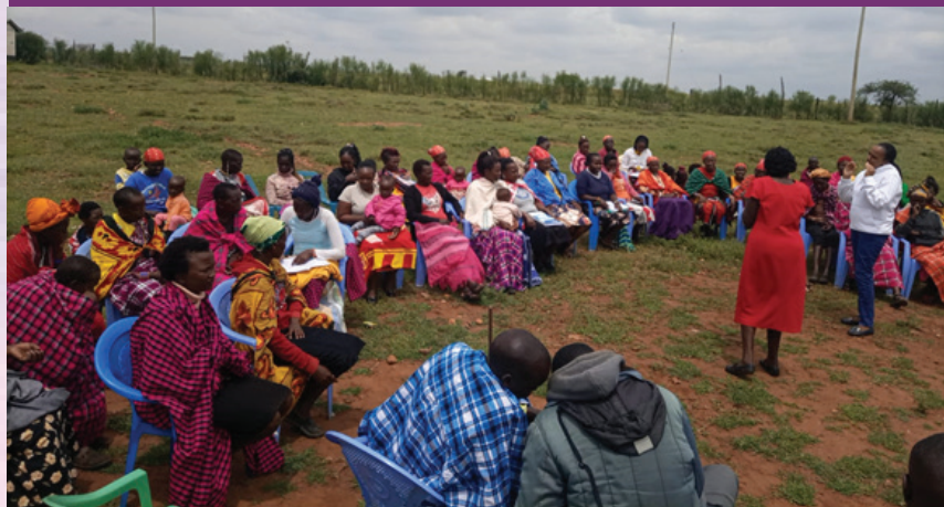
Group members being addressed by the LIP (Shekinisho CBO) and ENA Staff.