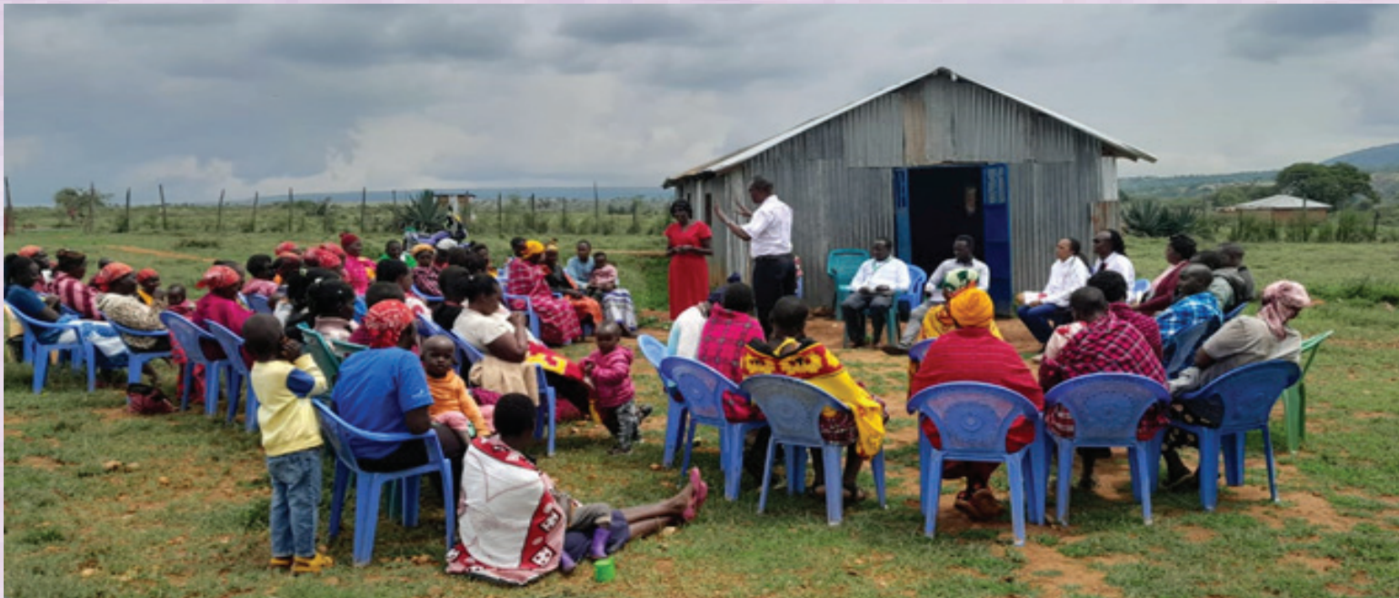
Group members attentively listening to the officers of ENA & Juhudi Kilimo.

The team verified the savings records of each group during the meeting, underlining the commitment to transparency in fiscal transactions. Notably, the women were informed that this process would be a continuous practice in future meetings, emphasizing the long-term nature of such an impactful collaboration. The initiative represents a beacon of hope for the women of Naroosorwa, promising not just water security but also a pathway towards economic independence and a n attainable bright future for the entire community.