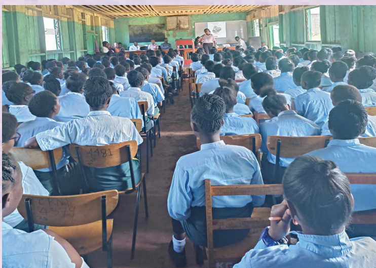
Mentorship Programme at Kithangari School in Meru on International Education Day

The mentorship session, a beacon of empowerment, delved into critical issues such as children's rights, gender equality and the prevention of violence against children. Facilitators engaged participants in discussions on life skills; emphasizing decision-making, communication, and resilience.