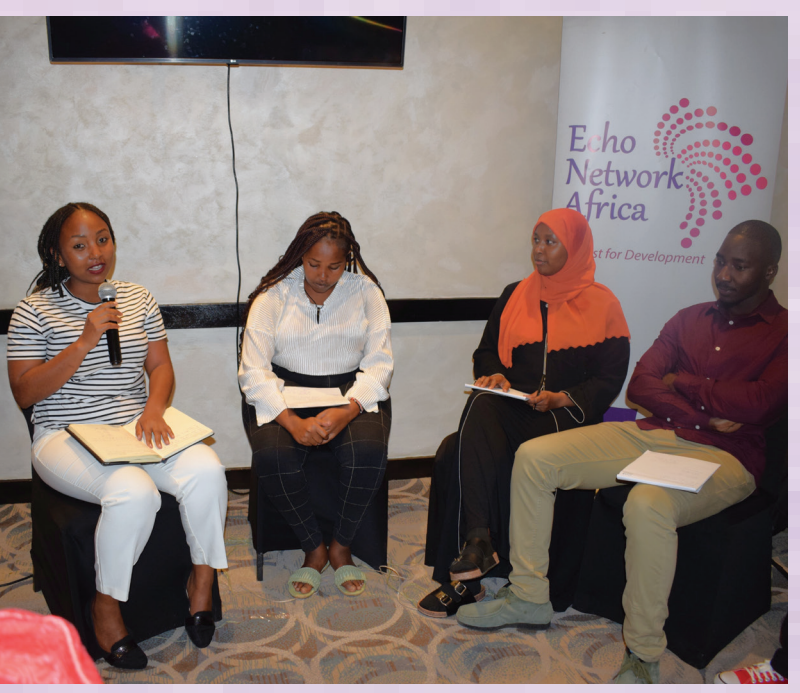
Media practioners group discussion on best practices for GBV documentation.

Human stories about gender-based violence can impact public opinion and policies in a powerful way.