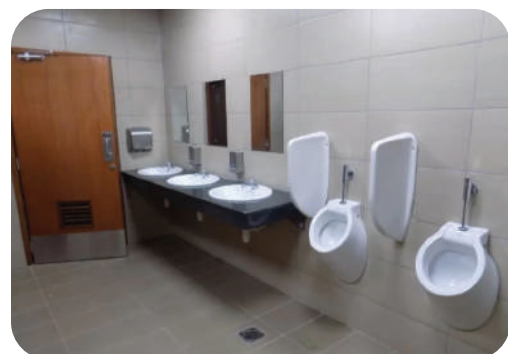
Ample clean sanitary facilities.