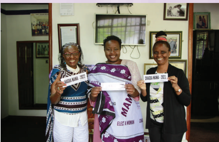
Chagua Mama Stickers

Chagua Mama campaign materials including posters and lesos for women political aspirants.