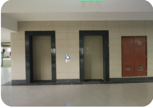
Lift access to all floors