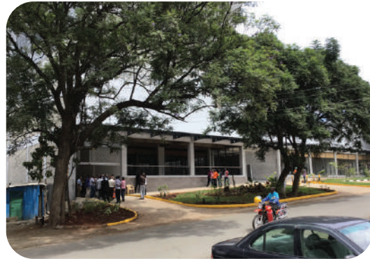
Good access roads