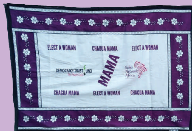
Chagua Mama Leso