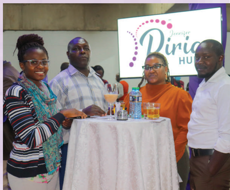
Members of the Nakuru Business Community pose for a group photo during a networking session.