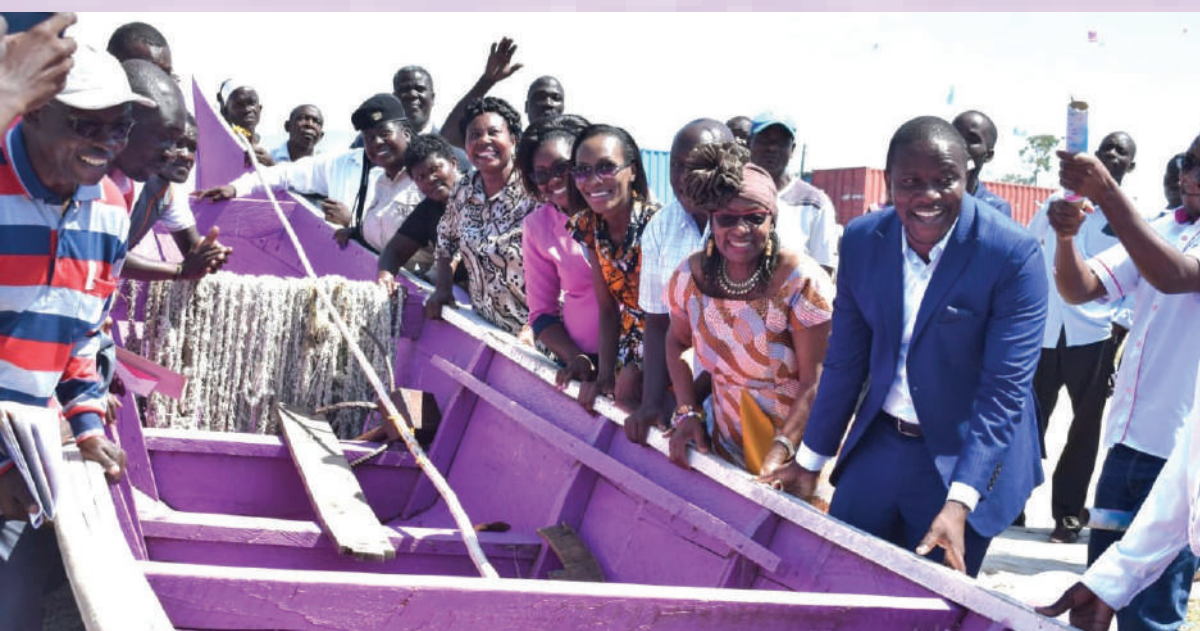
Stakeholders, invited guests and beneficiaries from the Aquaculture Initiative symbolically row one of the launched engine motor boat back into the lake.