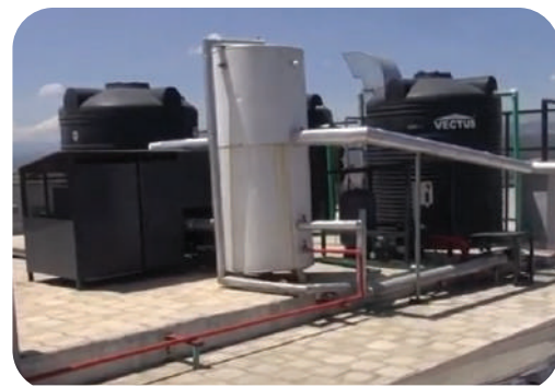
Sufficient water backup