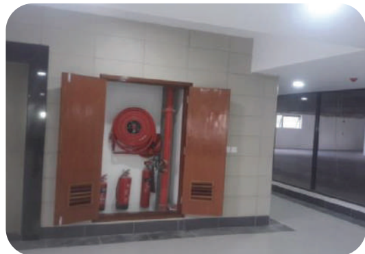
Ample fire response equipment