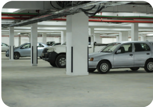
Ample parking spaces