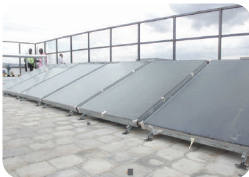
Water heating solar panels