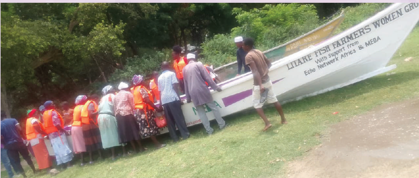
Litare women group inspecting the Engine Motor Boat donated by ENA