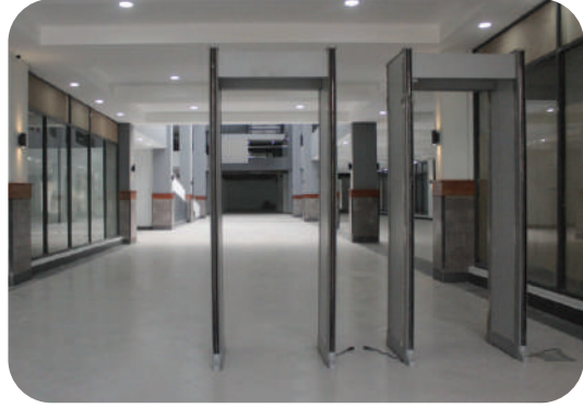
Entry point detection system