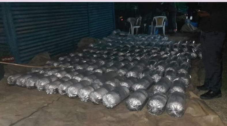
Strategic Restocking: Fingerlings packaged and ready for restocking