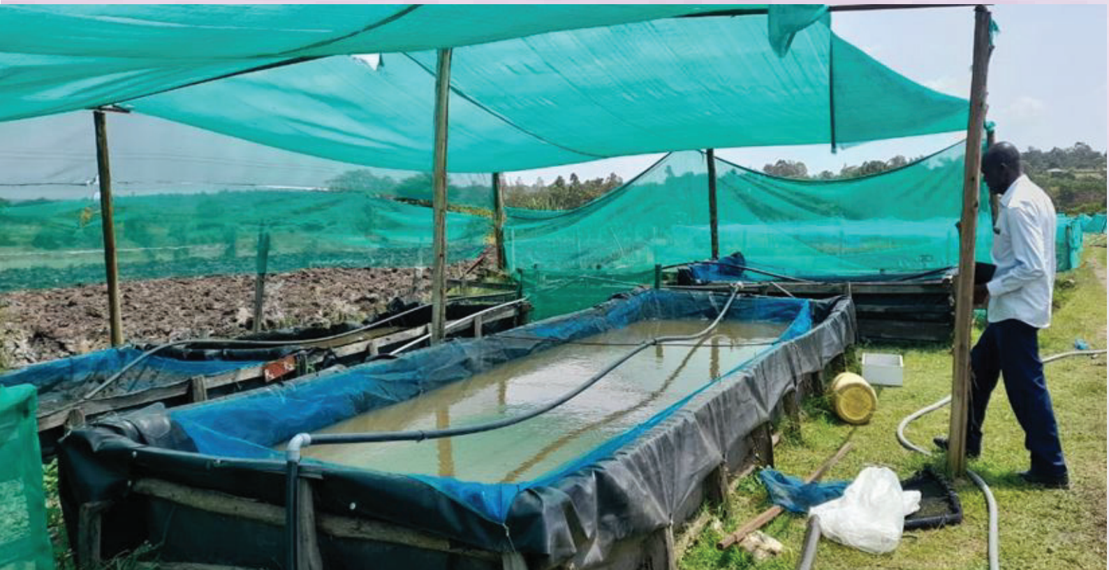
Strategic Restocking; Fingerlings Brooding Pond at Muga Farm

The packaging process on the other hand is whereby the fingerlings are taken from the brooders or ponds into transportation bags usually done at night or early morning depending on quantity and weight of fingerlings required. The smaller the size of fingerlings the shorter the time for packaging and vice versa.