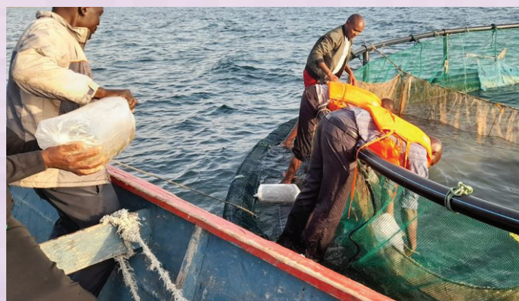
Strategic Restocking: Fingerlings restocking process into Mrongo Cage.