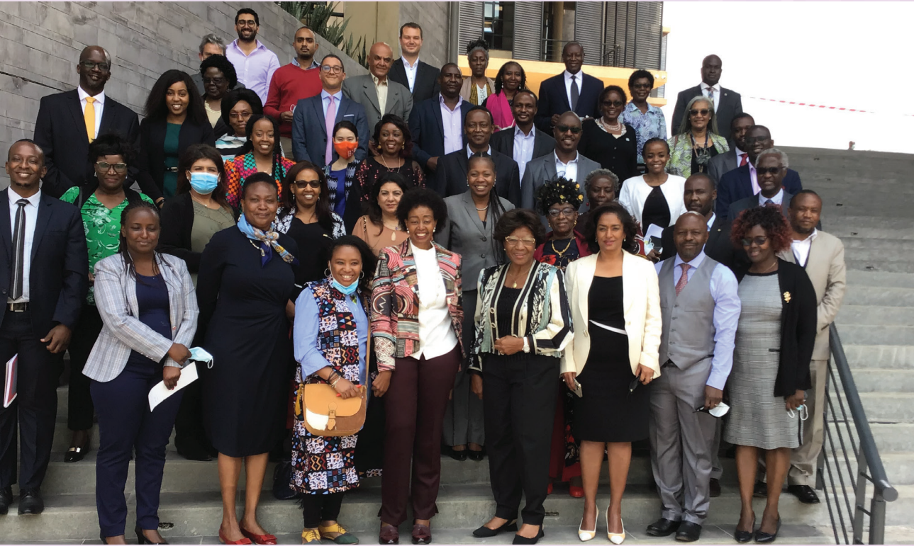
United in Purpose: Stakeholders pose for a group photo after the successful soft launch of the Kenya Women and Childrens Wellness Center soft.

partners like ENA in an aim to empower women economically and create Gender Based Violence prevention, response and referral programs.