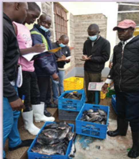
Rio Fish farm personnel offloading harvested fish from Mrongo Women Group for purposes of sorting and weighing.