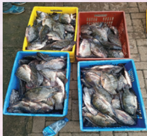
Size four (300 g and above) fish sorted out in crates for purchase by Rio Fish Farm.