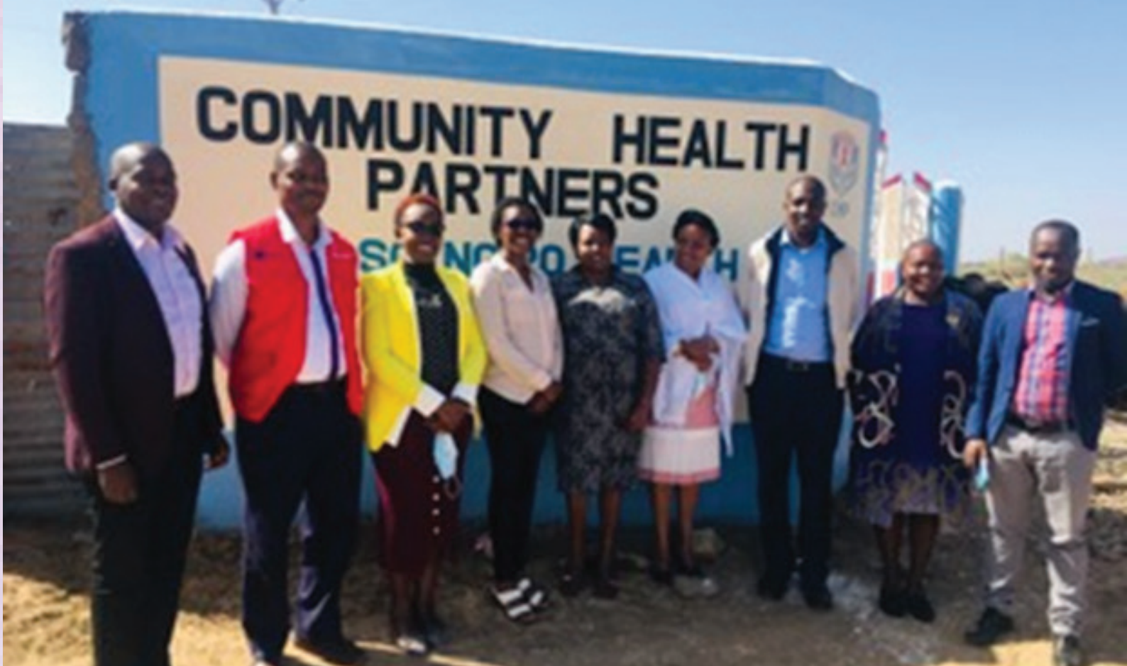
Echo Network Africa team pose for a group photo with Community Health partners in Narok County after an inception meeting to lay ground for the Girls Excel initiative activities in the County.