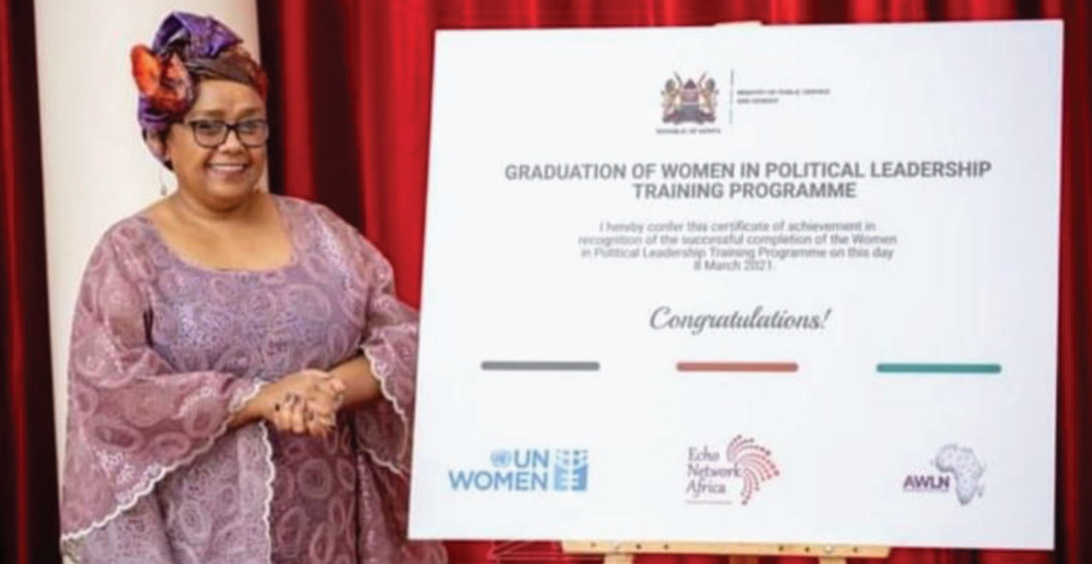
Hongera: Her Excellency, Margaret Kenyatta, First Lady of the Republic of Kenya unveiled the certificate of ENA's Running to win program on IWD. The certificate will henceforth be awarded to women trained in the program.